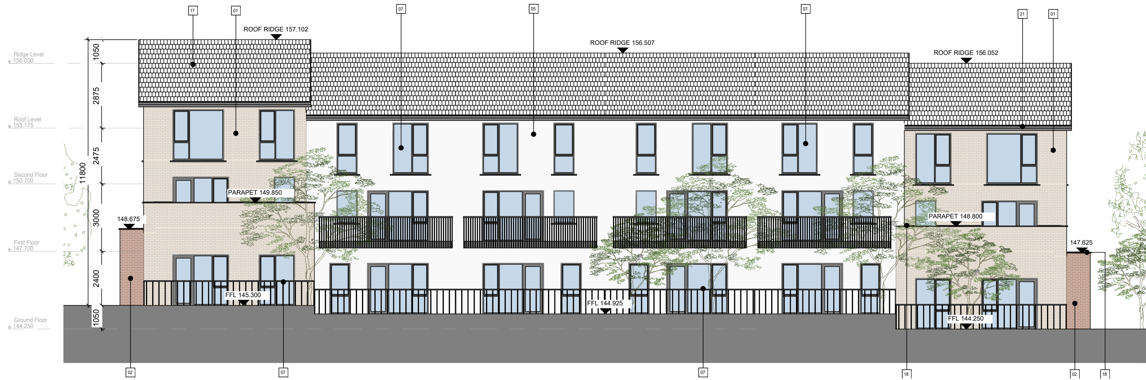
North Elevation SCALE: 1 : 100