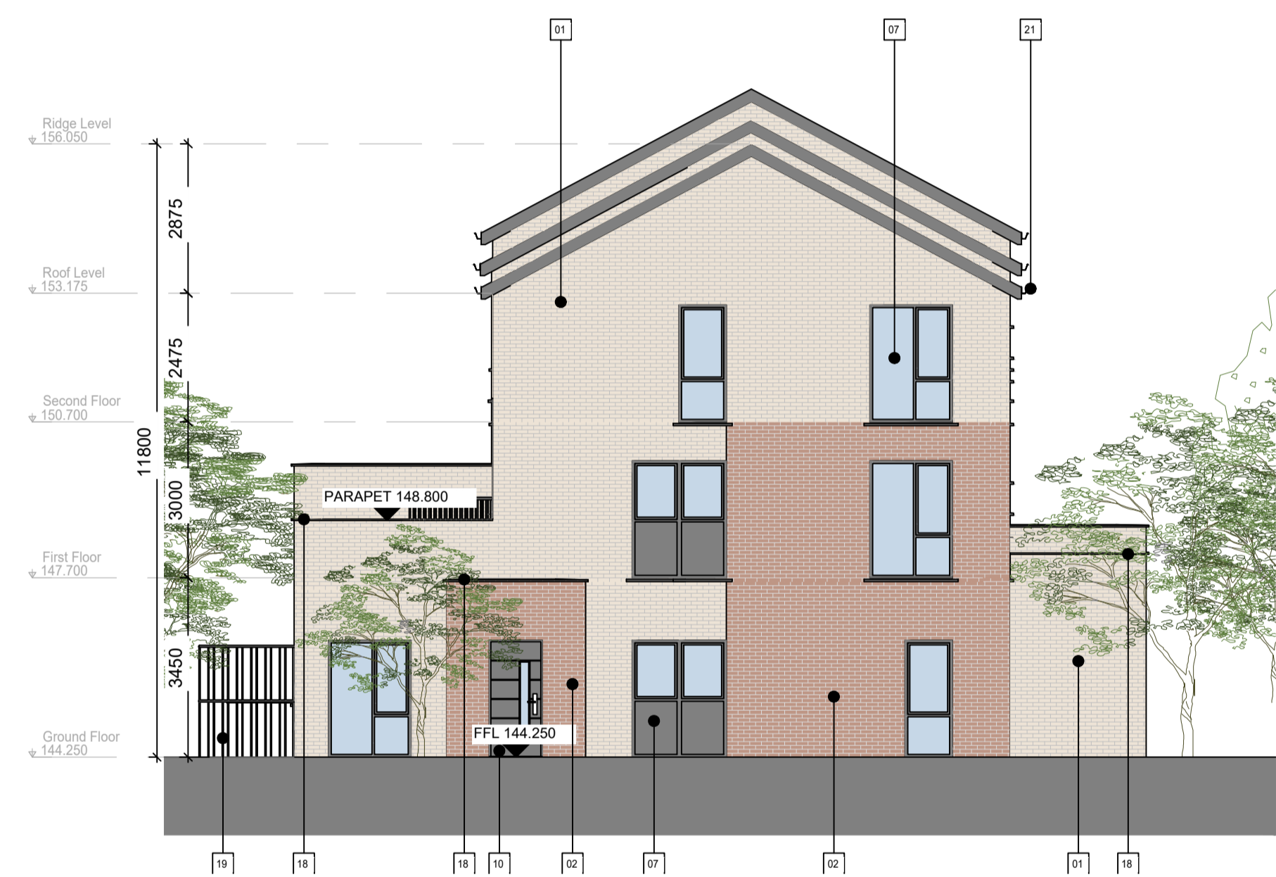
West Elevation SCALE: 1 : 100