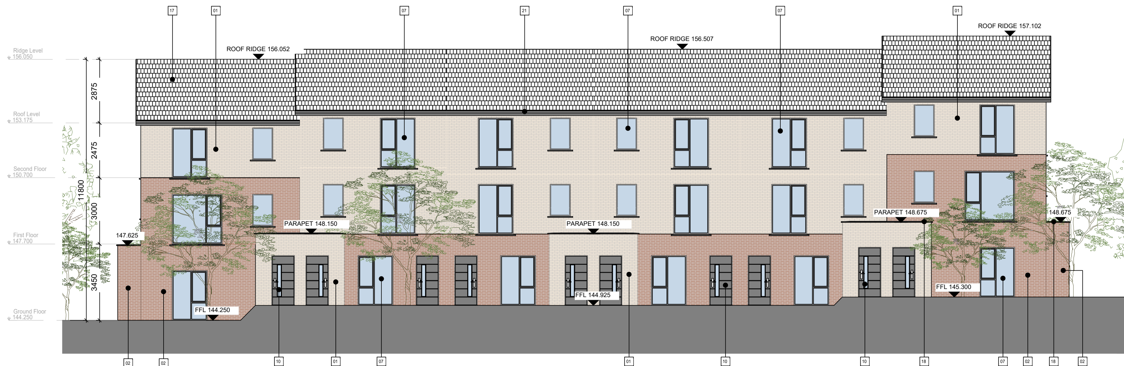
South Elevation SCALE: 1 : 100