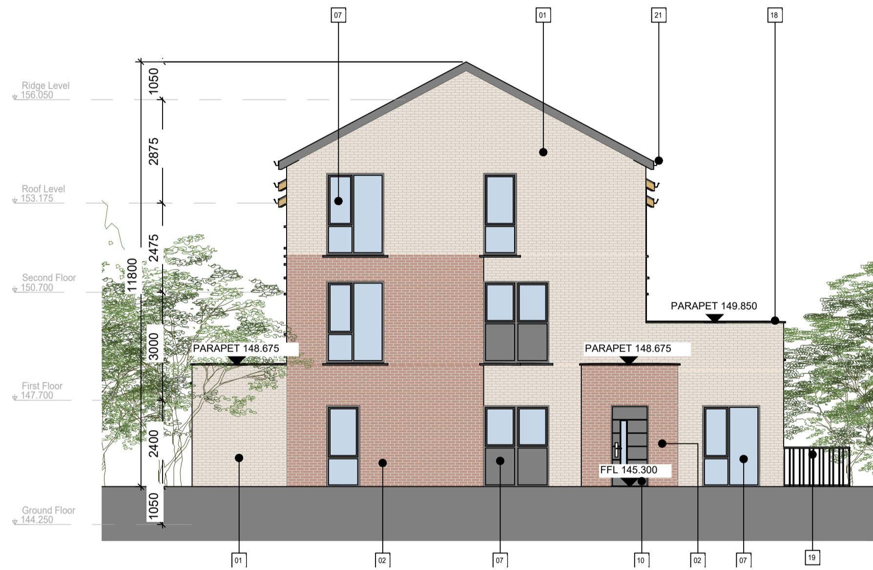
East Elevation SCALE: 1 : 100